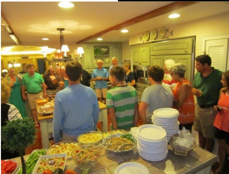
Lord, bless our friends, bless our food, and bless us to your service!